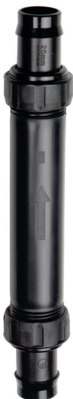
In-Line Filter 25 mm